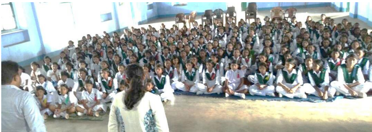
Safe-Touch Unsafe-Touch session with school children

The child protection program implementation in a school involves informing the school management about the process of developing the child protection policy. The school management is also made aware of the laws on child protection. The school teachers are trained on recognising child abuse and responding to child abuse. Sessions on the code of conduct with children are done with the teachers and the school support staff. Follow-up sessions with school counsellors on child mentoring and a session on positive discipline is also a part of the policy implementation. The Safe Touch Unsafe-Touch workshop is conducted with children to teach them to protect themselves from unsafe touch.